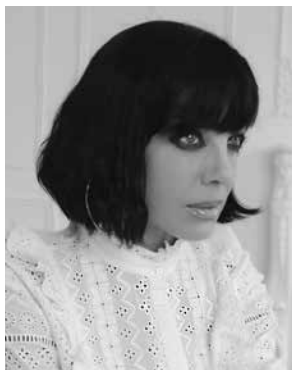
Dr Beth Allen a.k.a. Bif Naked Doctor of Fine Arts, honoris causa

A gold and platinum-selling rock star, best-selling international author, hit songwriter, international performer, human and animal rights advocate, Dr Beth Allen – better known by her stage name Bif Naked – is an icon of Canadian rock music. Working more than two