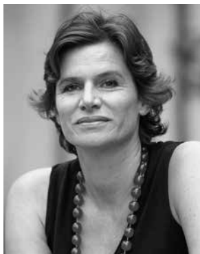
Dr Mariana Mazzucato Doctor of Laws, honoris causa

Celebrated economist Dr Mariana Mazzucato is a professor in the Economics of Innovation and Public Value at University College London, where she is the founding director of the Institute for Innovation & Public Purpose. She advises policymakers around the world on