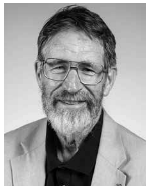
Dr George P. Smith Doctor of Science, honoris causa

innovation-led growth, including the governments of Scotland, South Africa, Norway and Sweden as well as the Organisation for Economic Co-operation and Development (OECD) and the United Nations. She is the author of award-winning books The Entrepreneurial State (2013) and The Value of Everything (2018), and most recently won the 2018 Leontief Prize for Advancing the Frontiers of Economic Thought and the 2019 All European Academies Madame de Staël Prize for Cultural Values. New Republic dubbed her one of the 'three most important thinkers about innovation' and Wired named her as one of the top 25 people shaping the future of capitalism.